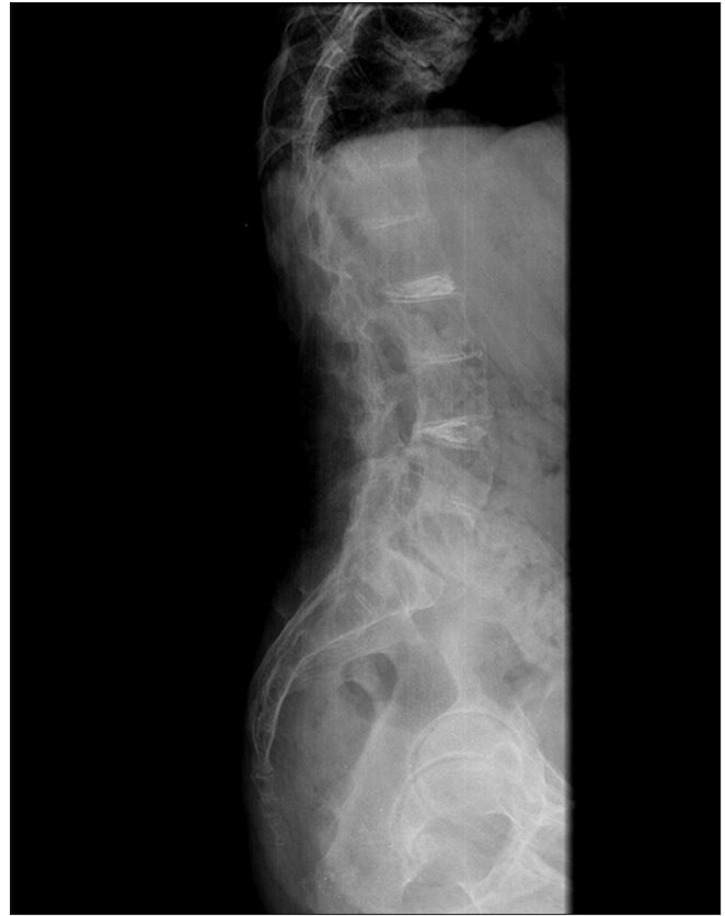
Figure 3: Lateral radiograph of the lumbar spine showing reduction of disc space, vacuum phenomenon, and calcification of more than three intervertebral discs - the "sandwich spine" appearance (stage 3)

In stage 1, the radiological changes were similar to those seen in age-related degenerative changes except that they were seen at an earlier age.