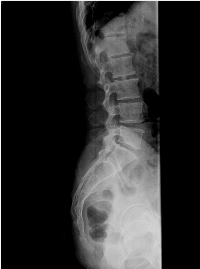
Figure 2: Lateral radiograph of the lumbar spine showing vacuum phenomenon and early changes of disc calcification involving less than three intervertebral discs (stage 2)

had kyphoscoliosis, while two had lumbar retrolisthesis. One patient with very osteopenic vertebrae had a compression fracture of the T12 vertebral body [Figure 5], which is a rare finding in ochronotic spondyloarthropathy.