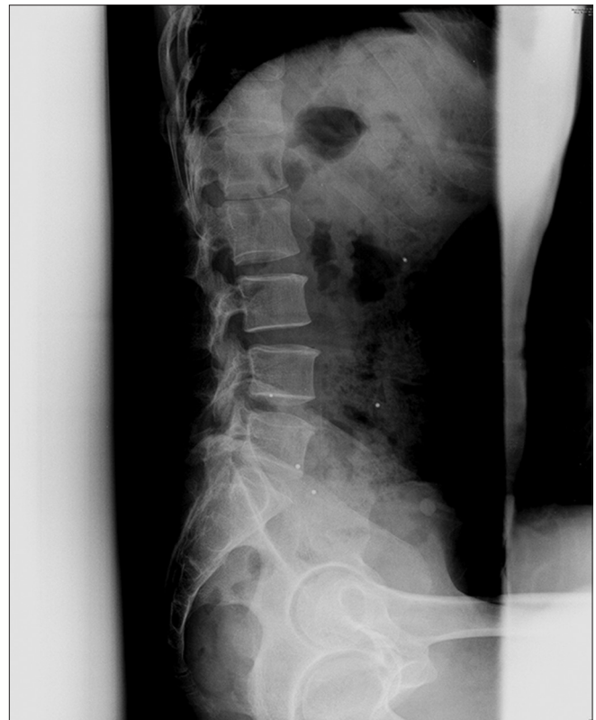
Figure 1: Lateral radiograph of the lumbar spine showing disc space reduction and endplate sclerosis (stage 1)

Thirteen patients with calcification of more than three intervertebral discs, reduction of disc space, vacuum phenomenon, and the “sandwich spine” appearance [7] were classified as stage 3 disease [Figure 3]. Nine patients with obliteration of the disc spaces and fusion of the vertebrae were classified as stage 4 disease [Figure 4]. Most of the patients in stages 3 and 4 had osteopenia. All except three