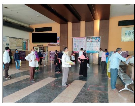
Fig 1: Designated boxes for patients to stand in queue maintaining adequate Social distance in the Registration area of Out-patient department.