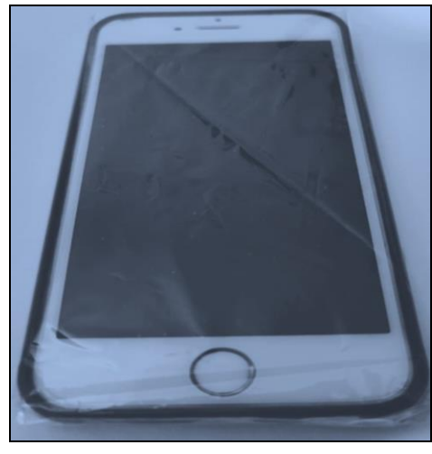
Fig 3: Using disposable transparent plastic wrap around cell phones.