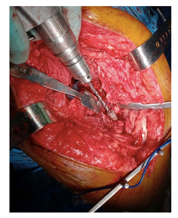
Fig. 5 Intraoperative picture showing drilling of the exposed upper surface of the distal fragment

readily one may have to sacrifice a little segment of bone from the fractured end. In case the above procedure is not applicable or fails to move the implant, one can make a small window just distal to the tip of the implant and reverse hit the implant to remove it from the fracture site. William Harris described extraction of the broken stem using the Midas Rex extraction system [22]. A hole is drilled over the exposed upper surface of the distal broken stem followed by a side cutting drill to create an undercut in the metal (Fig. 5). The extractor that fits into this undercut is locked into position and, in turn, is attached to a cannulated T-handle and then to a slap hammer to extract the broken stem. The advantage with this technique is that neither a window nor the osteotomy is necessary. The distal cement column can be left intact. An uncemented stem can also be removed after disintegrating it from the bone. If all these procedures fail, one has to opt for osteotomy as for the proximal fragment. Apart from this, there are different extraction techniques particularly the removal of distal fragment, described individually in the literature in the cases with fracture of the femoral stem alone on a cases to case basis [23-26]. The authors also believe that the technique of removal depends on the individual case to case and the availability of the final reconstruction option depends on the remaining bone stock and the age of the