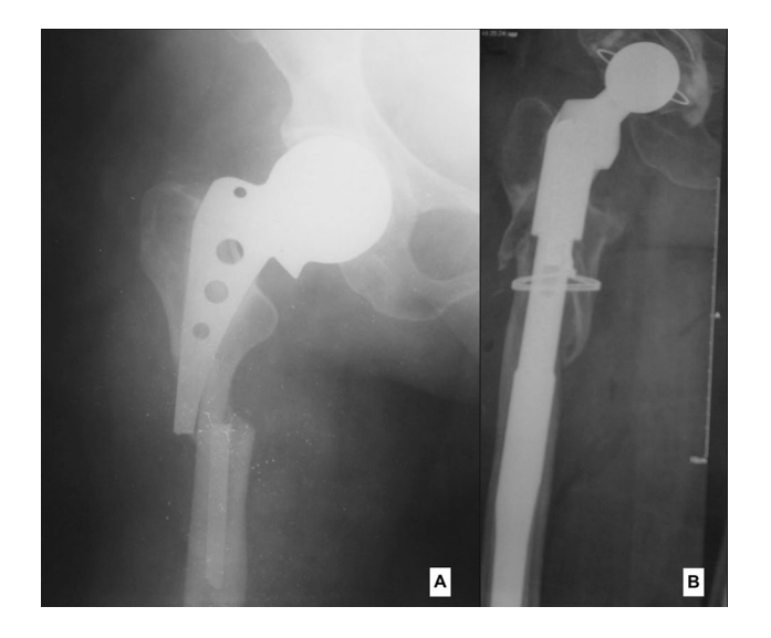
Fig. 1 A and B Radiograph showing periprosthetic femoral fracture with fracture of Austin Moore Prosthesis (A). Revision surgery was performed with a modular stem (B)

M male, F female, AMP Austin Moore prosthesis, ETO extended trochanteric osteotomy, HA hydroxyapatite