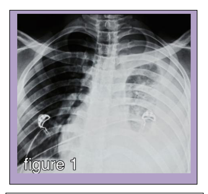
Figure 1 X ray chest showing left hemothorax

anticipated. It can be debated whether minimally invasive thoracoscopy could have been employed earlier, but the patient initially improved. Thus, similar chest trauma management principles should apply whether rib fractures with associated hemothorax are recognized early on during a patient's initial presentation or at a later date. Most of these cases need close observation, repeated physical examination, and hospitalization. Hemothorax complicating blunt chest trauma is treated with a chest tube as it was in this cases. Thoracotomy is rarely needed unless the massive hemothorax causes hemodynamic instability or the tube thoracostomy is ineffective, for example, in the presence of organized