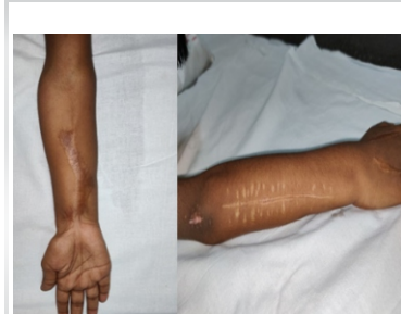
Figure 8: Complete healing of a surgical site clinically.