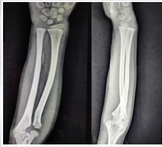
Figure 1: Anteroposterior and lateral radiographs of forearm after 1.5 years with clinical examination demonstrating complete bony union and TENS nail removed.