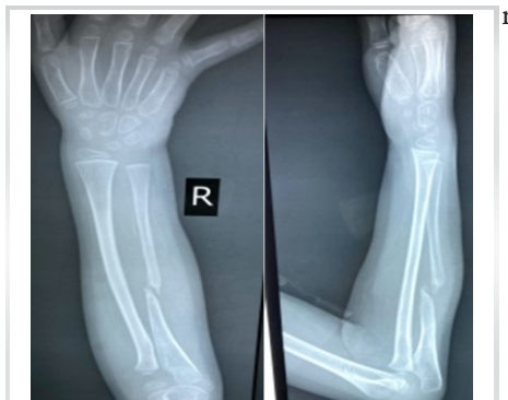
Figure 4: Antero posterior and lateral radiographs of forearm with Frank non-union at the drill hole-induced fracture site.

With persistent non-union for 6 months, the patient was taken up for surgery, where the non-union site was exposed and canal opened. No granulation tissue or other signs of inflammation were noted. Proximal end of distal fragment at the non-union site was thin and conical in shape with a gap of around 1 cm. 6.5 cm of fibula was excised with from the right leg, split, and wrapped around the non-union site. 6.5 cm of fibula was excised using minimally invasive technique [5] and split which were wrapped around non-union site. The site of osteotomy for fibula was marked 8 cm from distal fibula and 6 cm from proximal end. Two incisions were taken. Spatula was passed between the soleus and fibular muscles and step by step subperiosteal detachment performed cautiously. Then, the osteotomy was performed proximally and distally using oscillating saw. The graft was grasped with clamps and then the graft was mobilized on its axis by rotating it and the bone graft extracted. Iliac crest cancellous bone graft was harvested and placed at the non-union site to enhance union. To hold fibula in place, vicryl cerclages were taken. The construct was stabilized by a 2 mm intramedullary Titanium Elastic Nailing System (TENS) nail. Postoperatively, AE slab was given for 4 weeks for immobilization. Two doses of IV antibiotics (inj. Cefuroxime as per weight) were given postoperatively. Post-operative X-ray is