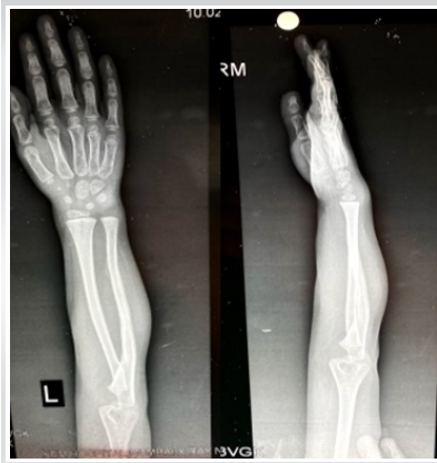
Figure 1: Anteroposterior and lateral radiographs of forearm at presentation.