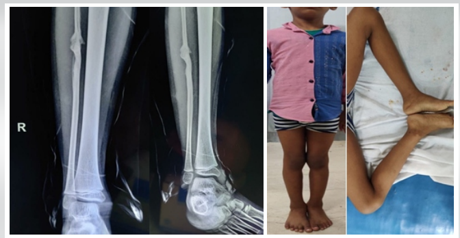
Figure 9: Radiograph and clinical photo of donor site (right Ankle).