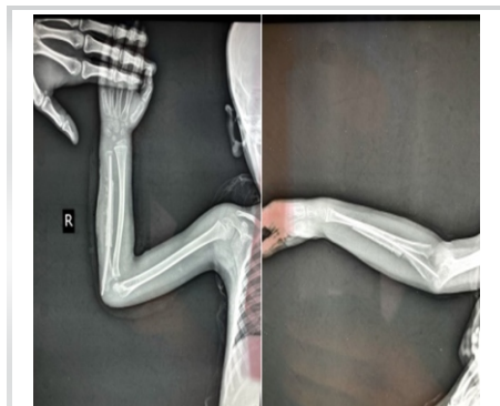
Figure 5: Immediate anteroposterior and lateral radiographs of forearm with fibula strut graft and intramedullary TENS nail.