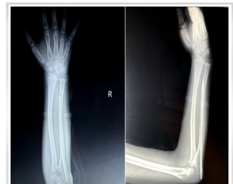
Figure 6: Anteroposterior and lateral radiographs of forearm show complete union of ulnar bone defect after 1 year.