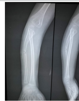
Figure 3: Anteroposterior and lateral radiographs of the forearm at 1 month post-surgical debridement. After 1 month, the patient developed a fracture just adjacent to drill hole location.

temperature. Motion ranging from 70° supination, 80 degrees pronation, and elbow flexion from 0 to 130°. X-ray examination revealed focal opacity with periosteal reaction in proximal one-third of ulna (Fig. 1). MRI findings were suggestive of periosteal elevation with underlying abscess (Fig. 2).