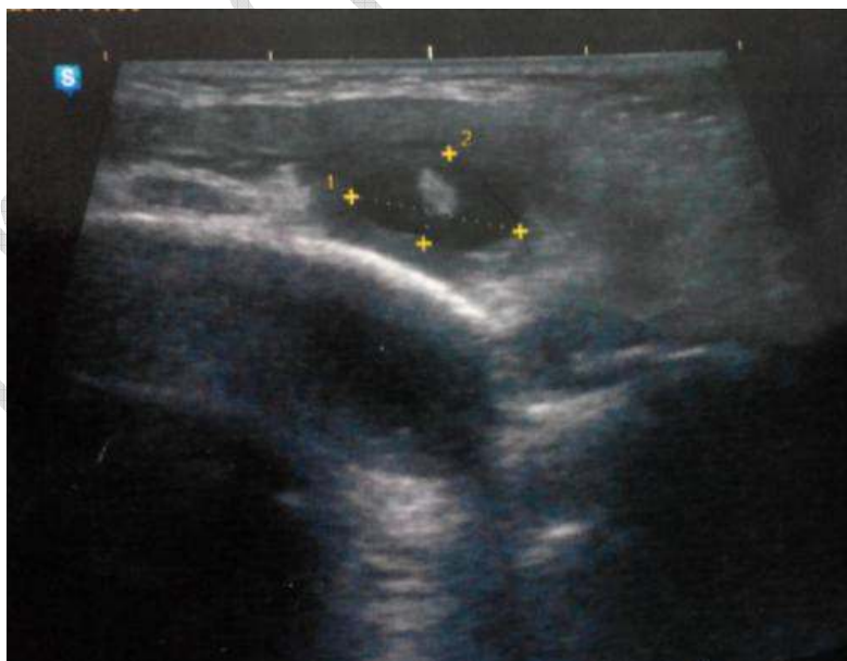
Fig. 1. High frequency sonography of right cheek showing cystic lesion with eccentric scolex diagnostic of cysticercosis

Human beings, both definitive and intermediate hosts, may accidentally or incidentally become the host of parasite in three ways: Faecal-oral infection, faecal-oral autoinfection and internal autoinfection. These eggs are partially digested in the stomach, evolve into oncospheres to penetrate the small intestinal mucosa and disseminate throughout the body eventually forming cyst [5]. An asymptomatic, isolated cyst may remain undetected, until it enlarges, migrates or dies and produces symptoms.