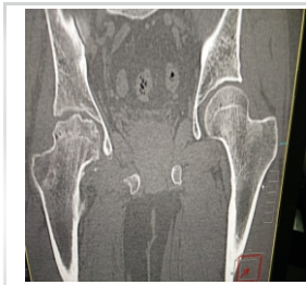
Figure 8: (a) Computed tomography image depicting maintained congruent reduction with early changes of avascular necrosis in right femur head for hip joint.