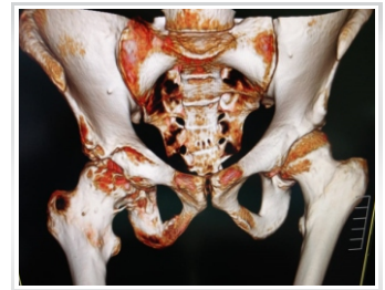
Figure 8: (c) Computed tomography image depicting maintained congruent reduction with early changes of avascular necrosis in right femur head for the hip joint.

months [1]. Gupta and Shrivat (1977) utilized “heavy traction” with 10–18 kg skeletal traction and sedation of seven patients for around 20 days, and achieved reduction in 6 of the patients. The successful reductions were in patients with dislocations that were <3 months old [4]. If the neglect is more than 3 months old as which was in our case of around 6 months, the open reduction becomes a difficult option, and preferred treatment approaches mentioned in the literature include THR, modified girdle stone procedure by Nagi and trochanteric osteotomy [5,6].