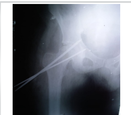
Figure 4: Radiographic image depicting stabilised hip joint with 2 steinman pins.

Old unreduced obturator variety of anterior hip dislocation is a rare entity. If the dislocation is identified early in the course it can be managed by closed reduction and immobilization alone with satisfactory results. In the case report by Kulambi et al. they were able to close reduce by Ali’s maneuver and maintain reduction of a rare anterior hip dislocation of obturator inferior type which came to their emergency within 2 h, whereas in our case the dislocation was neglected for a period of more than 5