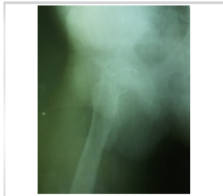
Figure 7: Post-operative right lateral hip Xray showing maintained congruent reduction of the right hip.