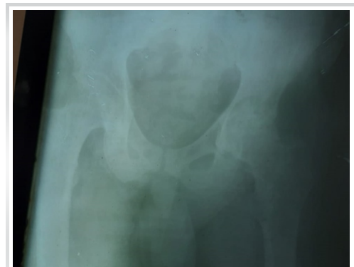
Figure 6: Post-operative AP view both hips showing maintained congruent reduction of the right hip.