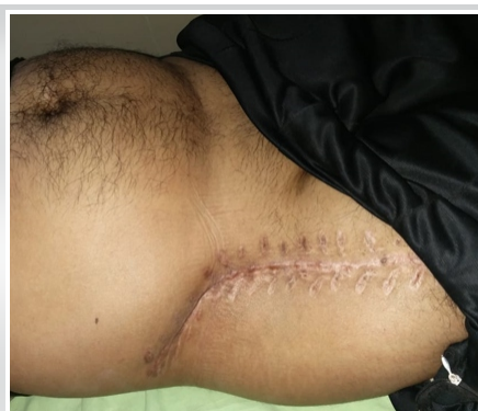
Figure 5: Clinical image showing healthy healed suture site.