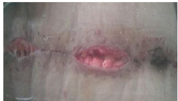
Figure 4: Ventral hernia superficial SSI.

All the above patients were discharged by post-operative day 4-9. Patients who had surgical site infection had to