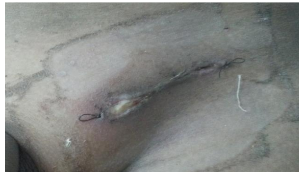
Figure 2: Inguinal hernia superficial SSI.