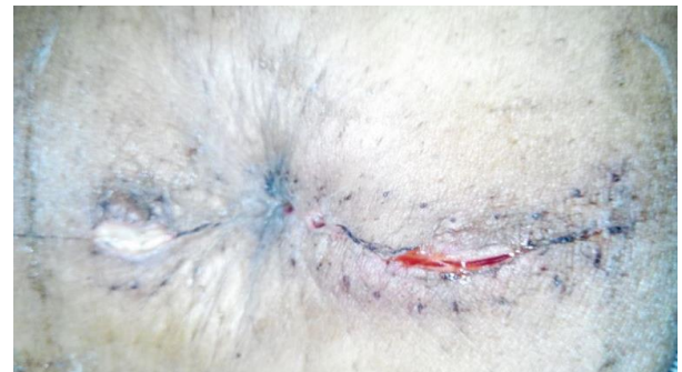
Figure 3: Umbilical hernia superficial SSI.