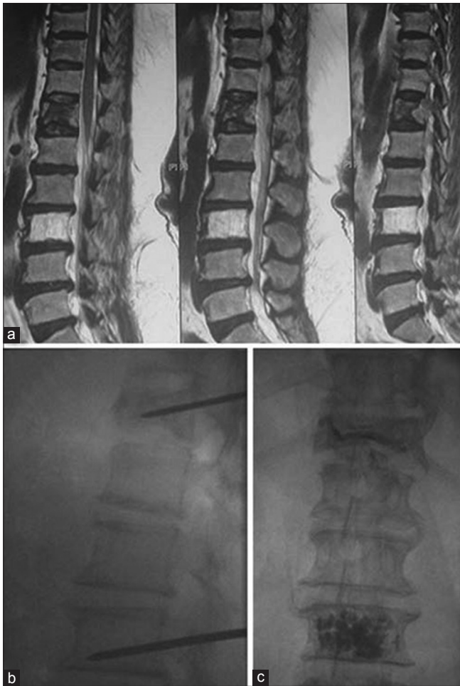
Figure 3: (a) Magnetic resonance imaging T2W sagittal view showing L3 vertebral hemangioma and osteoporotic compression fracture of D12, (b) Fluoroscopic view demonstrating needle position, (c) Vertebroplasty of L3 hemangioma and osteoporotic D12 vertebra

a good short term and long term outcome. Angiogram may not be performed in all patients of vertebral hemangiomas before vertebroplasty. However, if the bone cement flies off the vertebra during injection due to high flow, the procedure must be abandoned and angio-embolization may be done before reattempting vertebroplasty.