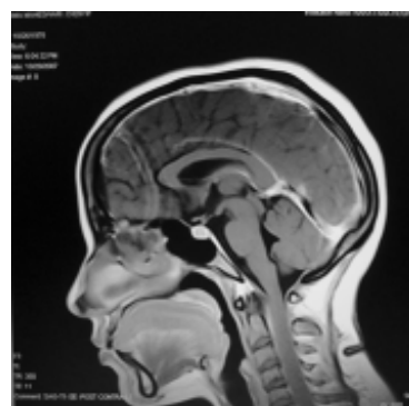
Figure1: MRI Brain, with gadolinium contrast showing well defined areas of contrast enhancement along superior sagittal and straight sinuses and bilateral tentorial reflections.

MRI T2W Brain plain was normal. MRI T1W Brain, with gadolinium contrast showed well defined areas of contrast enhancement along superior sagittal and straight sinuses and bilateral tentorial reflections